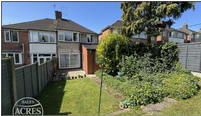
Dorrington Road, Birmingham, B42 1QS